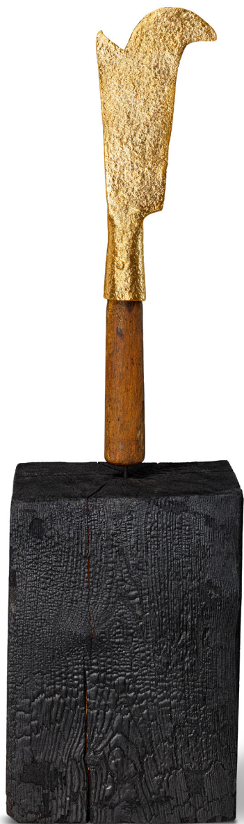
LE SOLEIL PETRIFIE N°2 Charred wood and gilded antique tool.