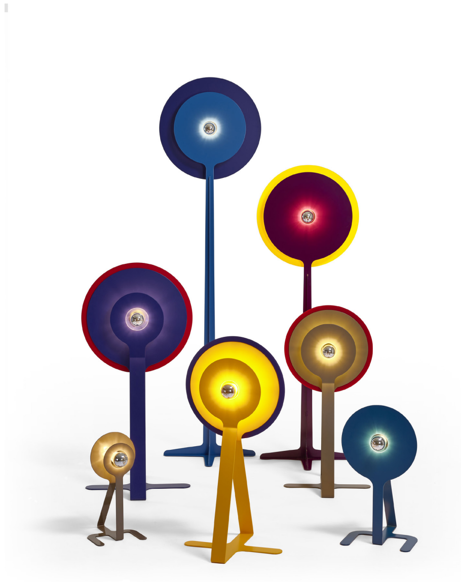
RANDOGNE Family of functional sculptures. Lacquered steel and aluminium.