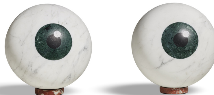
THE EYES OF THE COLOSSUS OF RHODES Marble inlays.