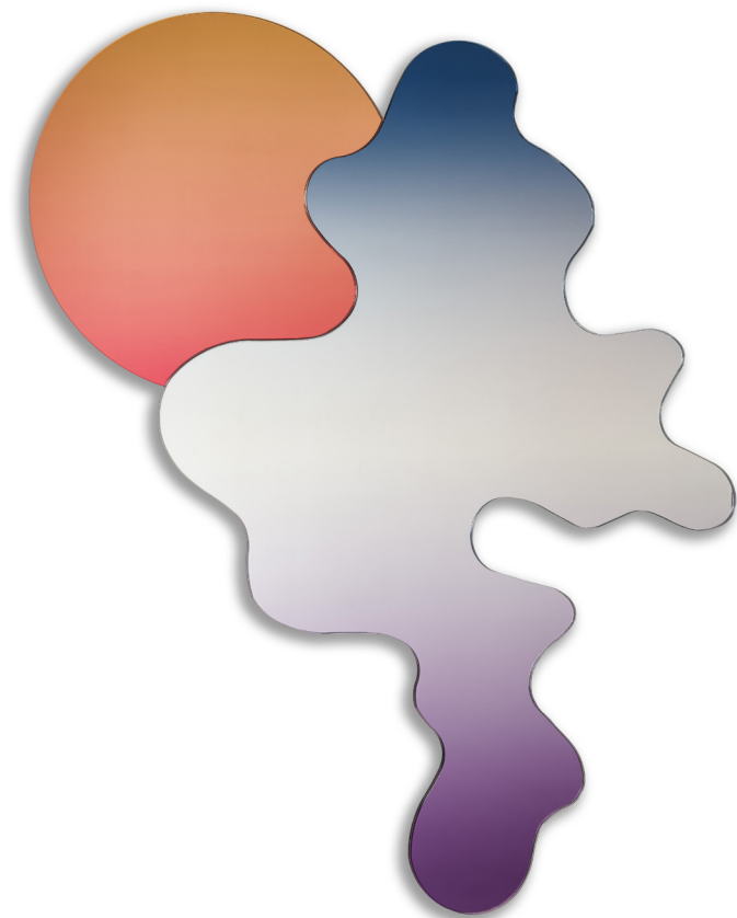
THE PHANTASMA SERIES: ONAR Wall Sculpture. Laminated mirror.