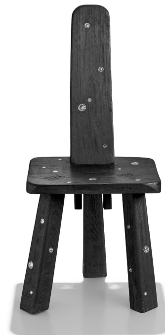
ALEA LACTA EST : GRUBEN Functional sculpture. Tinted wood and crystals.